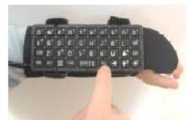
Wearable Wrist Keyboard

VisionBoard is a trademark of Chester Creek Technologies