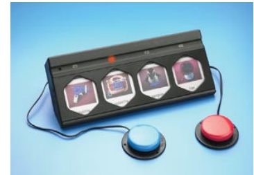
Scanning Communication Devices New FL4SH