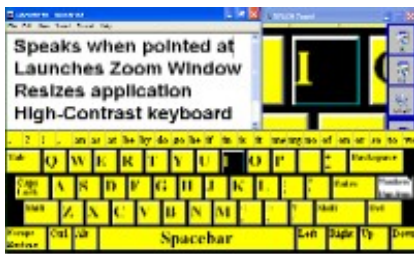
On Screen Keyboards