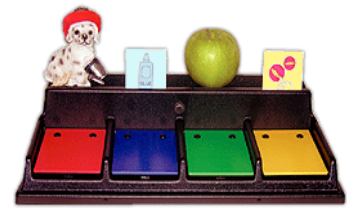
1 Level Communication Devices