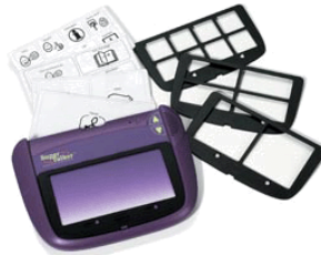
Multilevel Communication Devices New Devices