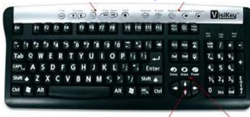
Compare Normal Keyboard Keys